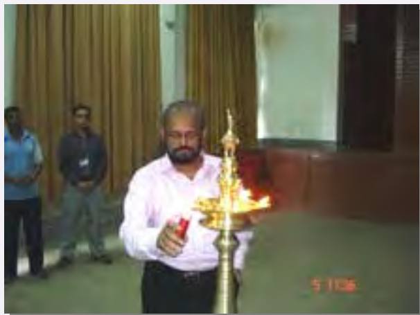
Inauguration of the DBIT-IETE-ISF