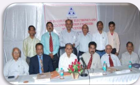
President, EC members and student representatives