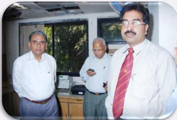
Analog Electronics Lab