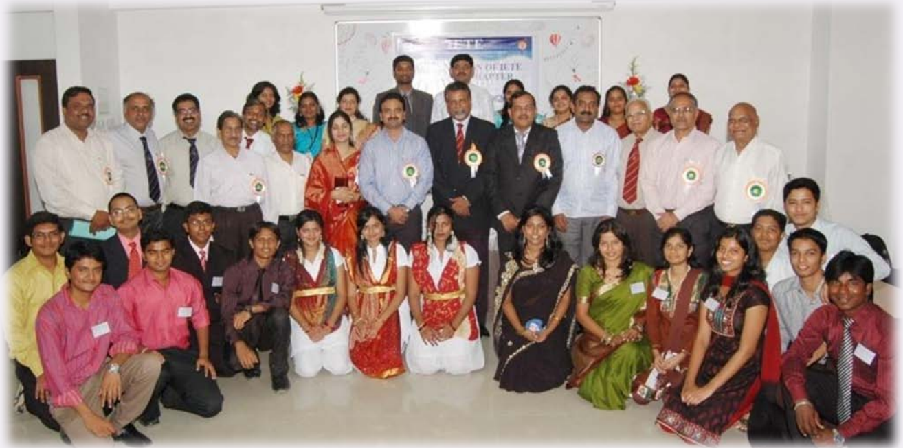
IETE Student Forum (ISF) at Shri L R Tiwari College of Engineering, Miraroad

Note: The Institution of Electronics and Telecommunication Engineers assumes no responsibility for the statements and opinions expressed by individual authors and speakers.