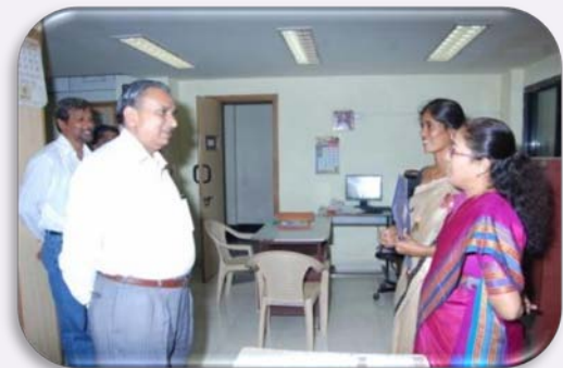
Interactions with office staff