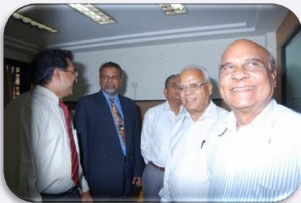
Digital Electronics Lab